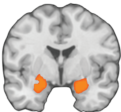
Figure 2. Results of the meta-analysis of brain regions modulated by reappraisal ( \gamma = -3 ; emotional baseline > reappraise).